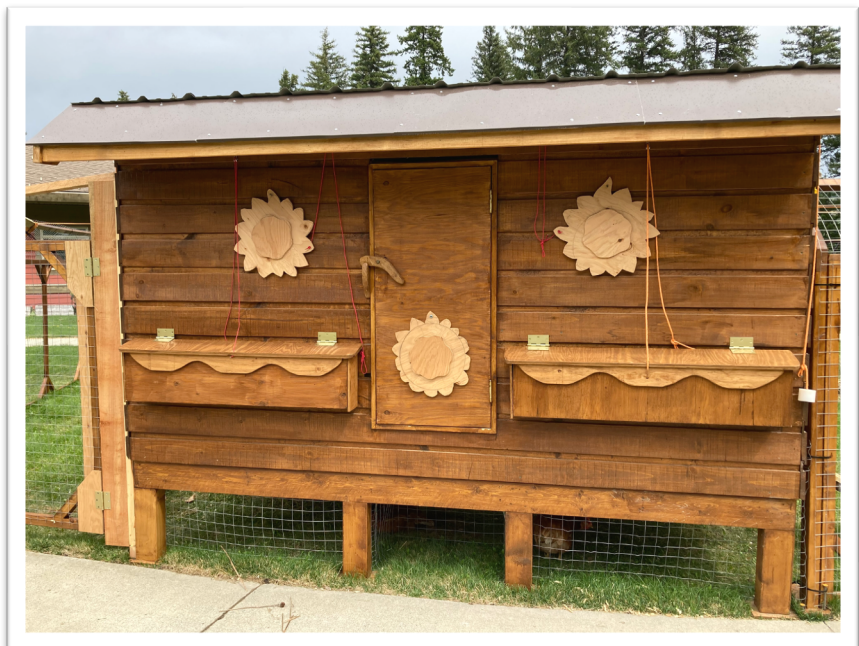
Front view of Chicken Coop- feeding doors