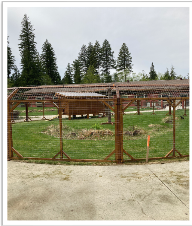
Chicken Coop at Forest View Place

The construction of the chicken coop was designed and coordinated by Daniel Boudreau with volunteer help from community members. The chicken coop was designed for ease of access for viewing and interacting with the chickens as well as egg collection. Residents who cannot get outside can easily view the chicken coop and run from inside the building.